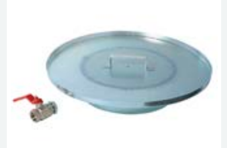
Grill and valve for separating solids from liquids inside the container