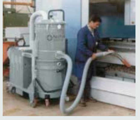
Metal sector: collection of shavings on machine tool