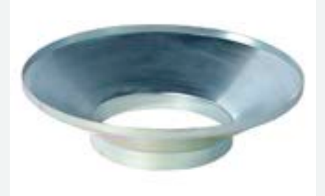
Removable cyclone that protects the primary filter from becoming in direct contact with incoming liquids or sharp objects