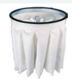
Standard star filter