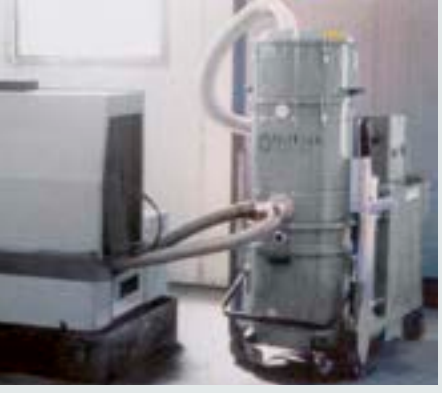
Fixed application for recovery of graphite