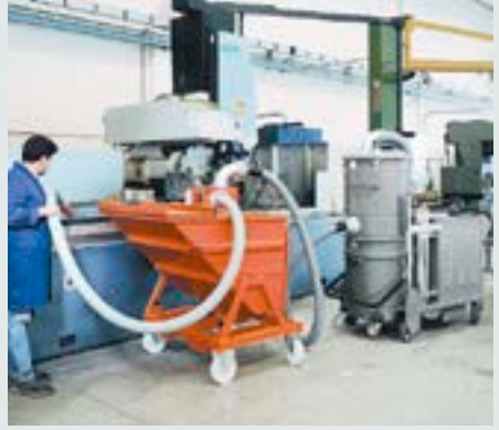
Metal sector: collection of shavings and oils